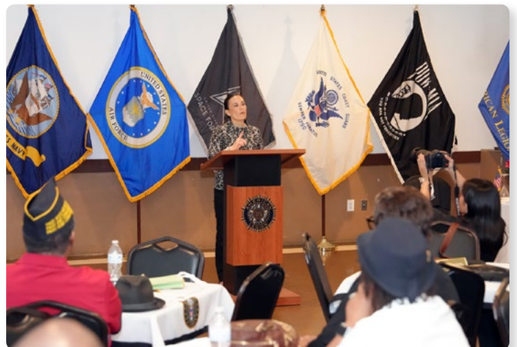
The Honorable Gina Ortiz Jones, mayor of San Antonio delivered opening remarks during a Memorial Day Ceremony held at Fred Brock American Legion Post No. 828