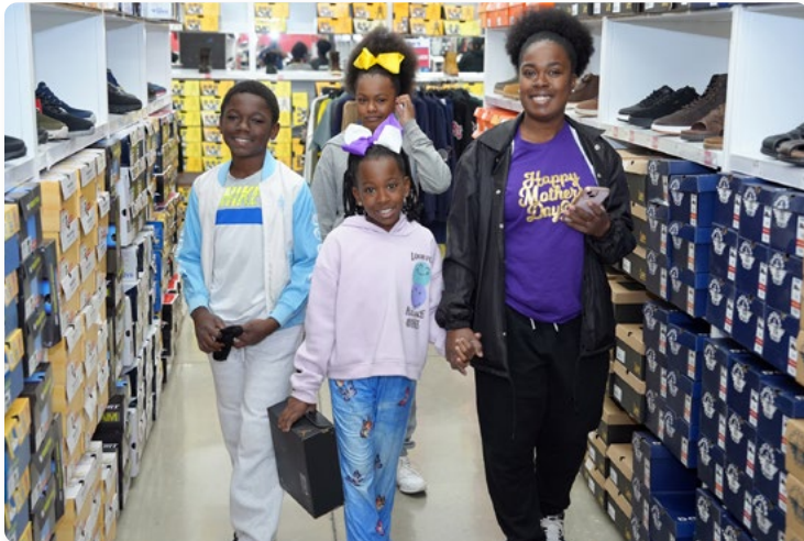
In support of one of its pillar programs, Children and Youth, Fred Brock Post 828, in cooperation with WSS, provided new shoes to students from the San Antonio Independent School District during Project Shoes held at WSS’ Southwest Military Drive location. Students, accompanied by their parent(s) or guardian(s), were provided with a $100 budget to purchase new shoes along with any other item in the store. More than $10,000 was available for students to purchase new shoes and apparel