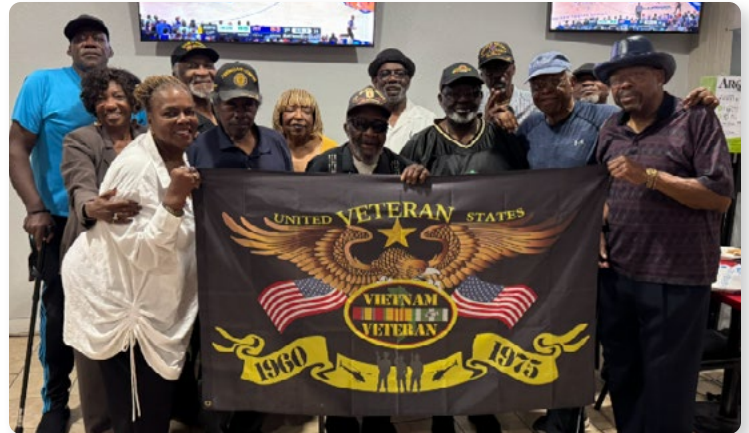
Vietnam Veterans in attendance at American Legion Post 832 Dinner

The Legion's National Commander has also emphasized the organization's advocacy for veterans' needs and their dedication to honoring the service of Vietnam War veterans. American Legion Post 832 plans to continue its commitment to honoring veterans through community events and outreach, ensuring that their sacrifices are remembered for generations to come.