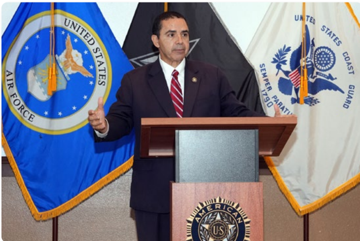
U.S. Rep. Henry Cuellar representing Texas' 28th Congressional District delivered opening remarks during a Memorial Day Ceremony held at Fred Brock American Legion Post No. 828