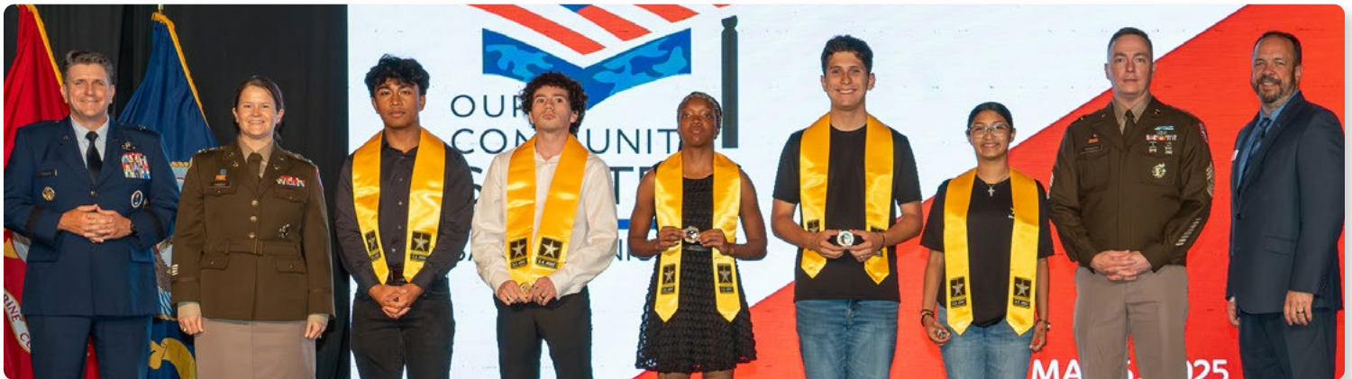
More than 240 high school students graduating this year from Bexar County and surrounding area high schools were honored during "A Night in Your Honor" hosted by Our Community Salutes - San Antonio (OCS-SA) at Pedrotti's Ranch. The students represented the range of military services to include the U.S. Army, Marine Corps, Navy, Air Force, Coast Guard, and Texas Army National Guard