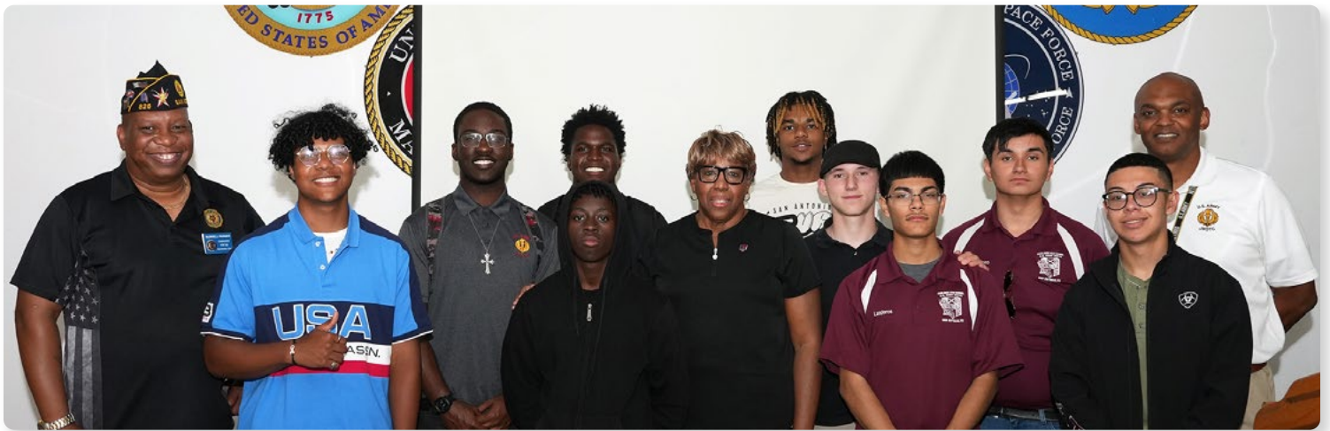
Fred Brock American Legion Post No. 828 is sponsoring 12 high school juniors to attend Texas Boys State at the University of Texas-Austin in June

In support of Texas Boys State and Texas Bluebonnet Girls State, the Post and Auxiliary Unit 828 is sponsoring 12 boys and eight girls for the weeklong programs.