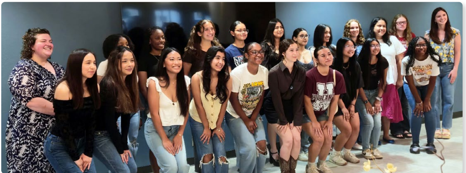
The 20th District, American Legion Auxiliary, Department of Texas' Reception and Orientation for Bluebonnet Girls State was held at the City of Converse Senior Community Center

They are participatory programs where students become a part of the operation of their local, county, and state government. At American Legion Boys State and Girls State, participants are exposed to the rights and privileges along with duties and responsibilities of a franchised citizen.