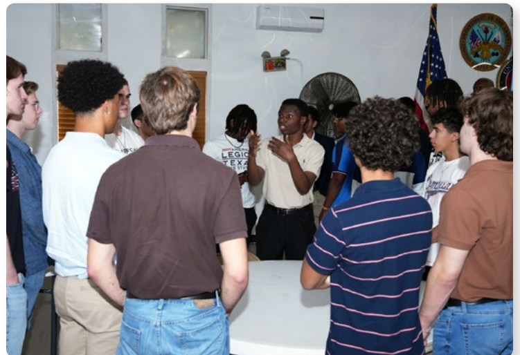
Texas Boys State alums participated in the 20th District, Department of Texas Boys State Orientation Meeting held at Alamo Post No. 2