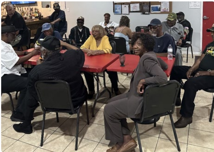
Vietnam Veterans in attendance at American Legion Post 832 Dinner