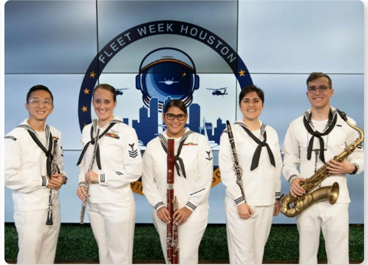
HOUSTON - (Sept. 09, 2025) - Navy Band Southeast Woodwind Quintet - Fairwinds performed at the KPRC 2 studio in Houston to promote the upcoming Fleet Week