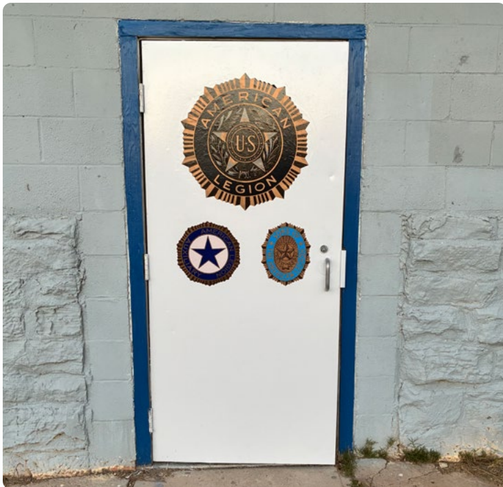
Post front door