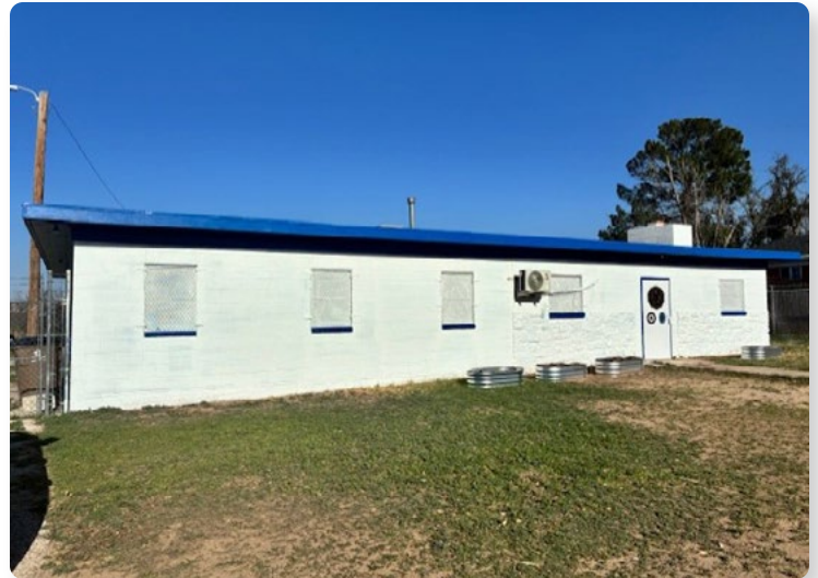
Front of our new home

On April 18, 2026, Post 572 will have our grand opening and American Legion Family Day rolled into one event. The invitees will be from TX Dept, San Angelo Mayor, Tom Green County Judge, Tom Green County Sheriff, San Angelo Chief of Police and Chamber of Commerce among others. The post will host a BBQ right after our monthly general membership meeting.