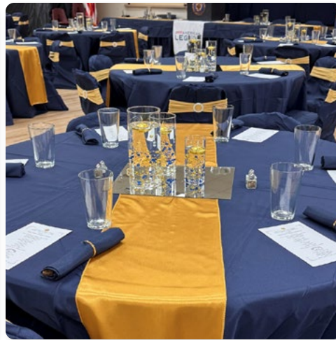
Table decorations and arrangements courtesy of the American Legion Auxiliary Unit 164