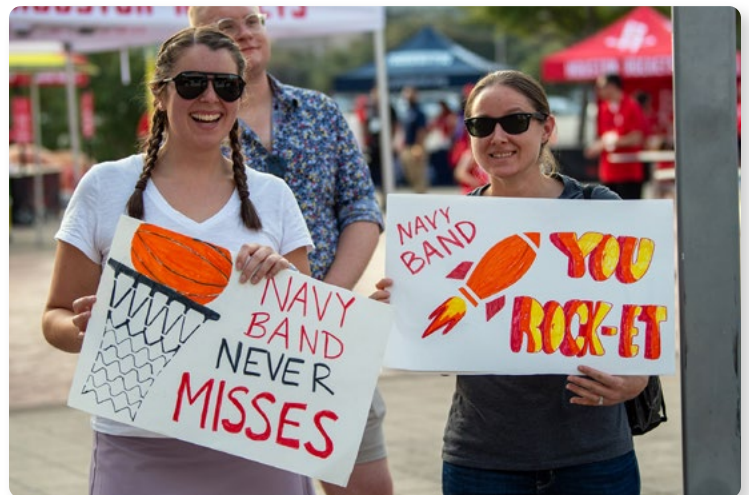
Fans of the Navy Band’s Fleet Forces Popular Music Group watch a performance during the Houston Rockets’ season opener pregame at the Toyota Center in October 2024.

Event Information: Fleet Week Houston EXPO POST Houston Saturday–Sunday, April 18–19 10:00 AM – 6:00 PM