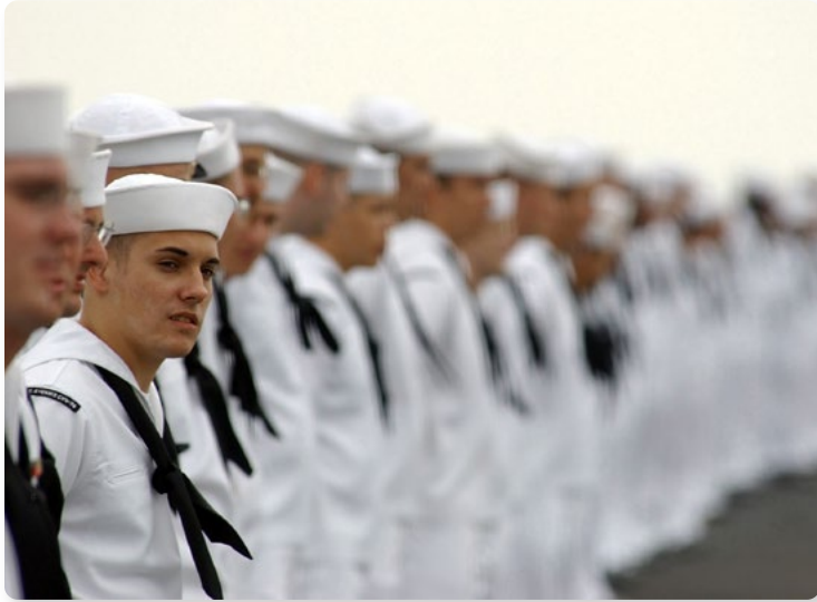
Sailors “man the rails” on the flight deck of USS John C. Stennis (CVN 74) as the ship arrives in port for the annual San Diego Fleet Week parade of ships ceremony, Oct 4, 2003.