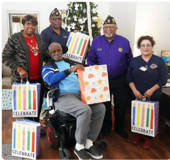
Members of Fred Brock Post 828 drop off gift bags filled with pajamas and socks for 20 residents of Normandy Terrace Healthcare and Rehabilitation Center located on the East Side