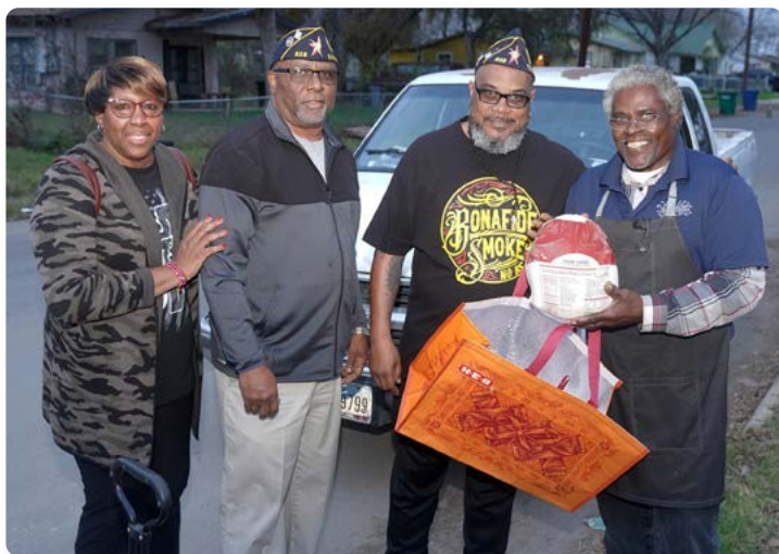
To spread Brotherly, Sisterly, and Neighborly Love, the Legionnaires of Fred Brock American Legion Post No. 828 went door-to-door to donate turkeys to residents in the immediate vicinity of the Post

Fred Brock Post No. 828’s mission is to enhance the well-being of San Antonio’s veterans, their families, the military, and the community by its devotion to mutual helpfulness.