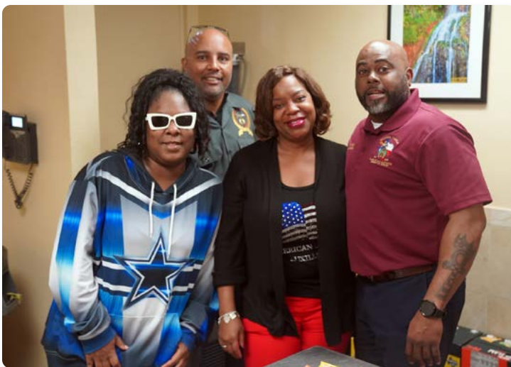
Legionnaires of Fred Brock American Legion Post No. 828, its Auxiliary and Sons of the American Legion volunteered at the 45th Annual Claude W. Black Community Center Holiday Gift Giveaway