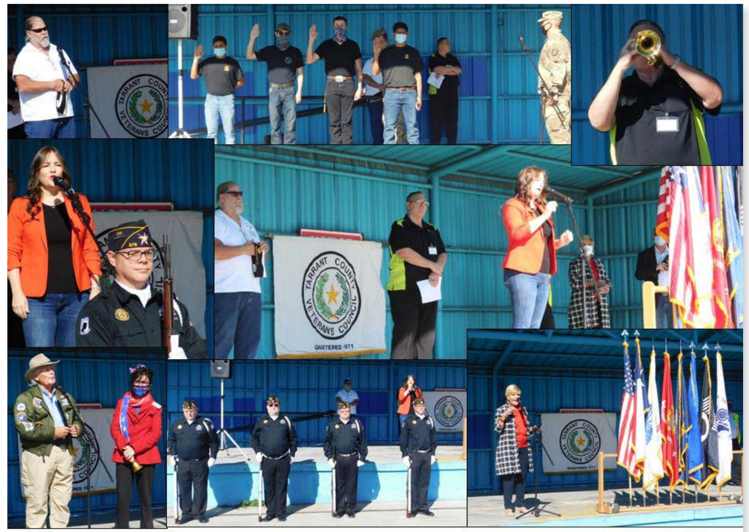
2020 Tarrant County Veterans Day parade Opening Ceremony

Since its beginning neither wars nor pandemics have kept us from honoring our veterans with a parade. The parade is organized by the Tarrant County Veterans Council partnering with the City of Fort Worth, Panther Island Pavilion, Tarrant County College and Buyers Barricades with financial support from the DAV and the North Texas Military Foundation.