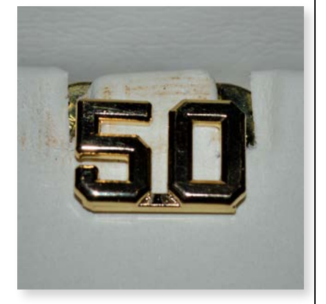
The American Legion 50-Year Pin.

He joined the U.S. Army in 1963 and the American Legion in 1968. When asked why he became a member and renewed all those years, he replied "I was proud of my military service and maintaining my membership enabled me to share fellowship with other veterans." For more information about Post 178 visit <a href="mailto:friscolegion.org">friscolegion.org</a>